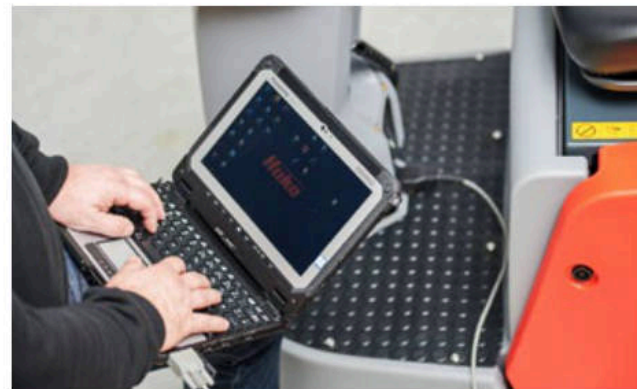
Easy access to the diagnosis interface for maintenance purposes and to modify machine settings.

Blue Competence is an initiative of VDMA (www.vdma.org). By engaging in this partnership, we are committed to comply with the twelve sustainability principles applied in the field of mechanical and system engineering (www.bluecompetence.net/about).