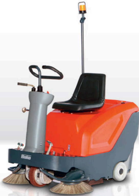
Sweepmaster B800 R